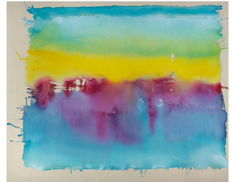
Inisfree, 72 1/2" x 89" 1970 acrylic on canvas

In 2018 Lipsky continues to reinvent both her work and herself. ♦