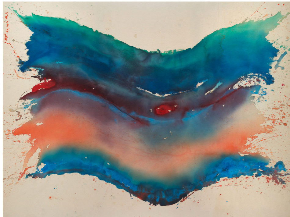
Chrysanthemum, 71" x 98" 1971 acrylic on canvas

Later in the seventies she started putting color next to color in large, precise grid-like pictures, some of which were oriented as diamonds. At the time Lipsky said, "These grid