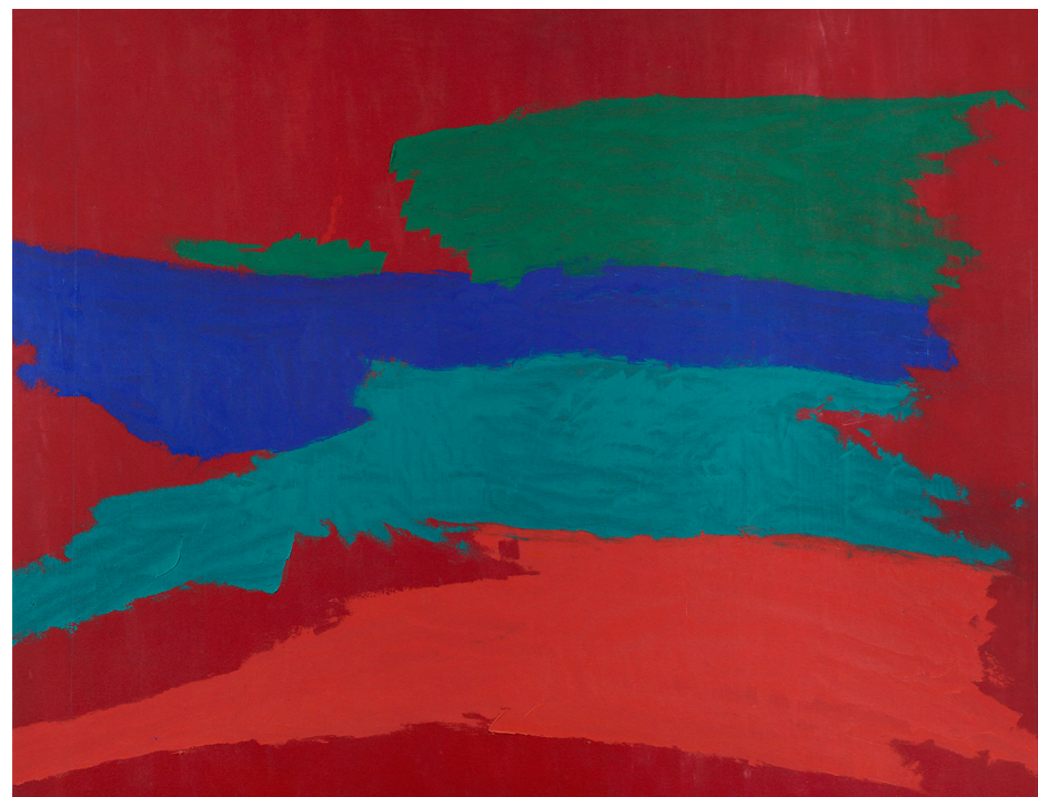
Disco, 77" x 98", 1973, acrylic on canvas, courtesy of the artist