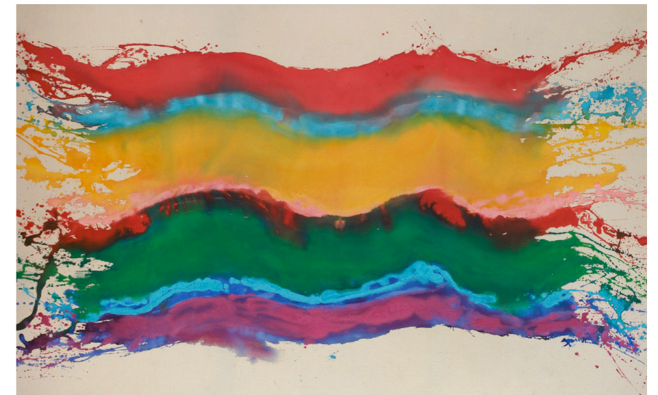
Spirals Fireplace, Springs Fireplace, 1969, 62 3/8" x 94 1/2", acrylic on canvas, courtesy of the artist